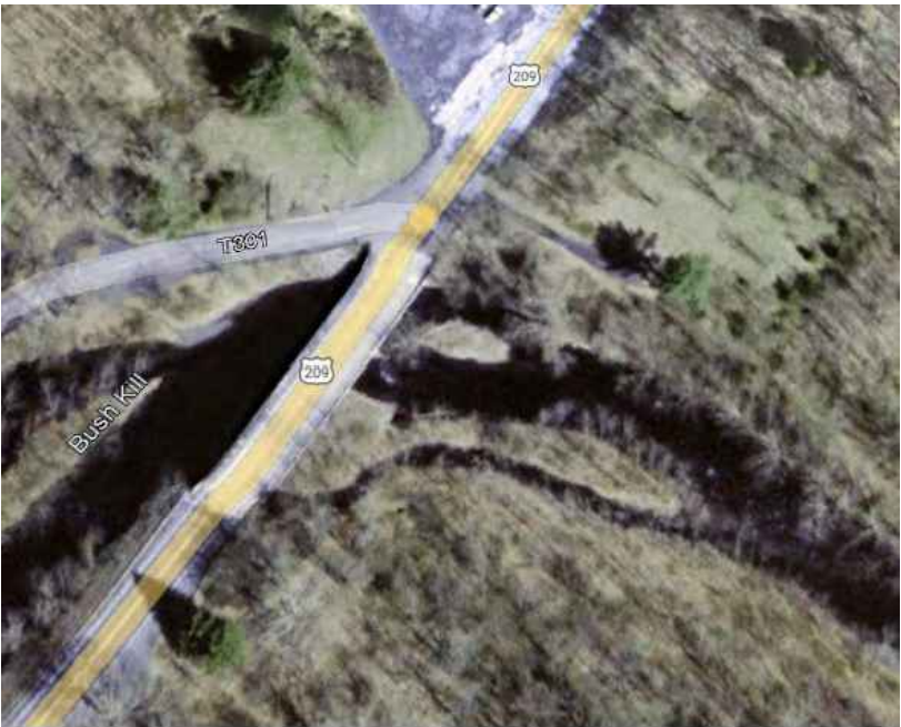
BUSHKILL CREEK AT US209 DECEMBER 2001