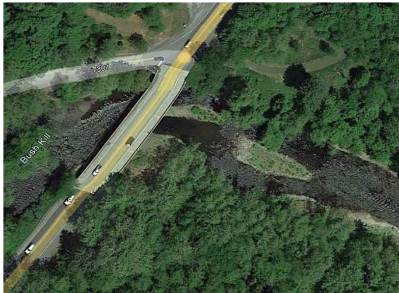
BUSHKILL CREEK AT US209 MAY 2015