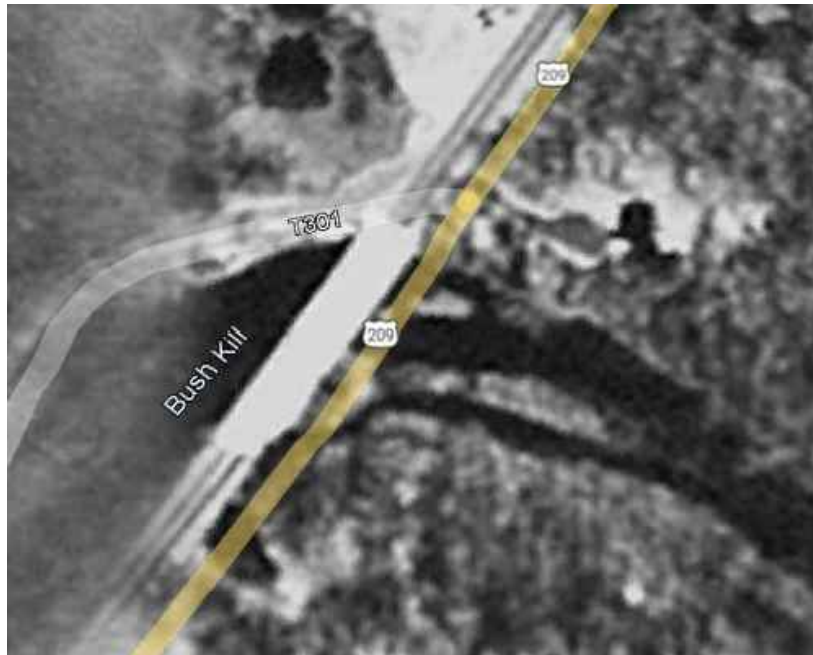
BUSHKILL CREEK AT US209 MARCH 1995