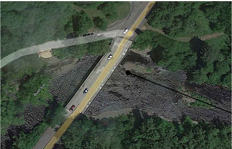
BUSHKILL CREEK AT US209 JUNE 2022

SITE OF PROJECT NP-DEWA 14(18), 121(1) REHABILITATION & MAINTENANCE OF BRIDGES. COMPLETED FEBRUARY, 2022. (SEE APPENDIX FOR BUSHKILL CREEK PLANS.)